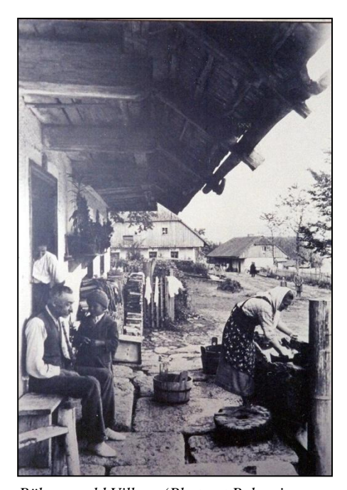
Böhmerwald Village (Photo at Bohemian Forest Museum, Passau, Germany, 1998)

The Counts of Nothaft, who were granted the territory in the seventeenth century, were the ones to found a glass industry in the Eisenstein valley. In 1771, the Eisenstein villages were sold to Johann Georg Hafenbrädl, a local master glassblower. Under his direction, the glass industry in the valley reached its pinnacle and the inhabitants of the Eisenstein villages enjoyed a degree of prosperity. By the end of the nineteenth century there were twenty different glassworks in the region.