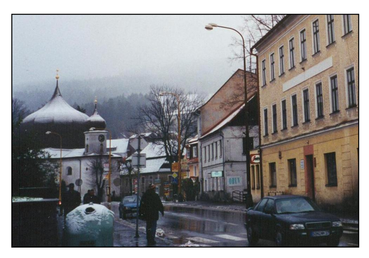
Markt Eisenstein with Maria Hilf Church in the background

Pleasures for the village inhabitants were simple. Beauty was found in nature and in simple crafts. A finely embroidered piece of cloth or a handmade and intricately painted piece of furniture were items to be treasured. Rich traditions, including the preparation of special foods, were developed to celebrate the holy days of the church, Christmas in particular. Snuff was a popular item and this substance was carried about in small glass bottles made in the region.