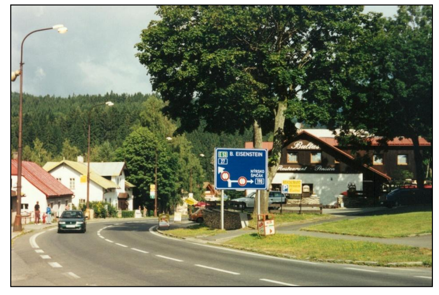
Outskirts of Markt Eisenstein, now Železná Ruda

At the beginning of the twenty-first century, the majority of homes and other structures in the village that were built before the turn of