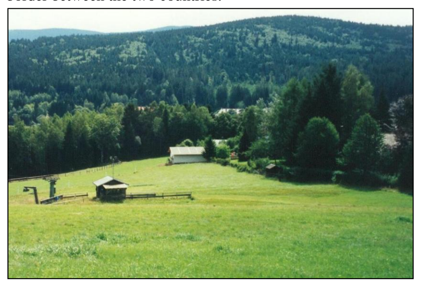
View of the Böhmerwald around Markt Eisenstein (Photo by SAM, 1999)

Markt Eisenstein, now known as Železná Ruda, is set in a pretty valley in the Bohemian woods, at the edge of the Šumava National Park. It is located in the south Bohemian region of the Czech Republic on the German/Czech border. Originally, this was the border between Bavaria and Bohemia. If one takes a map and draws a straight line between Munich, Germany, and Prague in the Czech Republic, Markt Eisenstein is located about the point where this line crosses the border between the two countries.