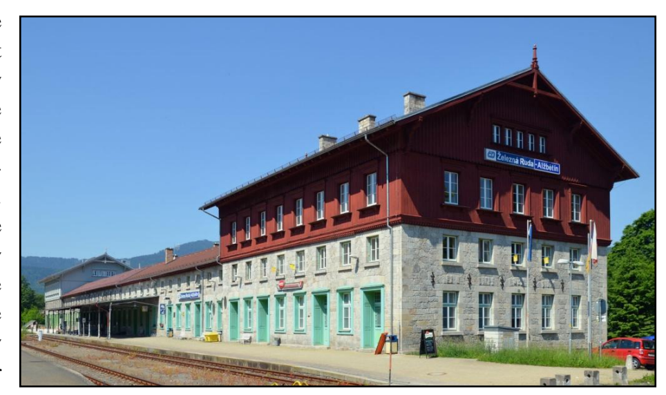
Train Station at Bayerisch Eisenstein, Czech side

The railway line clearly brought economic opportunity some of for the villagers living at the edge of the Bavarian-Bohemian forest. However, just as in the rest of Germany, many families living in the Eisenstein valley in the late nineteenth century believed that futures and fortunes lay in immigration to