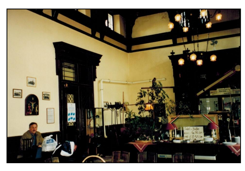
Interior of train station, Bayerisch Eisenstein

Bohemia, the rail line from Pilsen to Markt Eisenstein (now Železná Ruda) was finished and put into service, following the completion of a 1,747 meter (2 km-long) tunnel through Špičák mountain. This tunnel, built between 1874 and 1877, was the one of the first train tunnels to be built in the Austro-Hungarian Empire. It remained the longest train tunnel in Bohemia until 2008. This was the final link which would connect the Bohemian railway