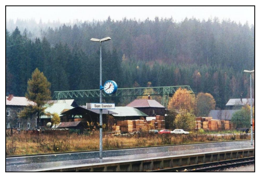
Bayerisch Eisenstein Railway Station (Photo by SAM, 1998)

According to the state contract signed by the Bavarian Eastern Railway Company in 1873, the train station was to be constructed so that the border divided the building into two equal halves. A symmetrical two-story edifice with wings in Bavaria and Bohemia and a common middle section was thus erected. On October 20, 1877, the building was officially opened by the Emperor of Austria and his Bavarian royal counterpart. It was known as the "Eisenstein changing post" or the Frontier Station. The waiting rooms were ornately decorated in the style of the era. To this day, the railway station has the distinction of being the only train station in Europe with an international border running through it.